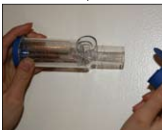
11. Put the cap back on

...wait ONE minute, then repeat steps 8-10