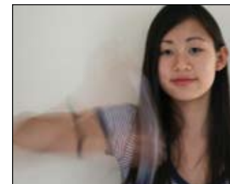
5. Shake well