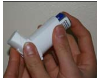
1. Take the canister out of its plastic holder