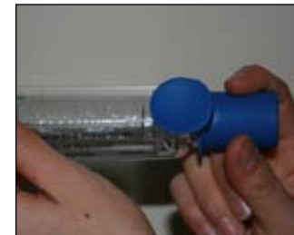
2. Take off mouthpiece cap