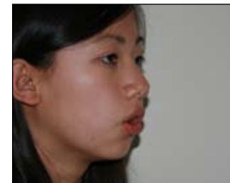
10. Breath out slowly