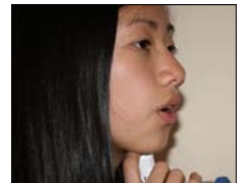
6. Breathe out completely