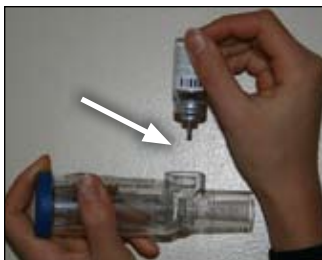
3. Put the canister into the Optihaler like this