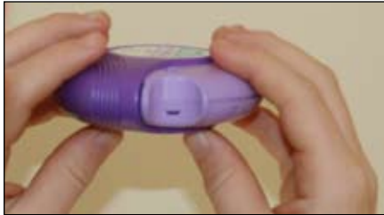
1. Hold it like this