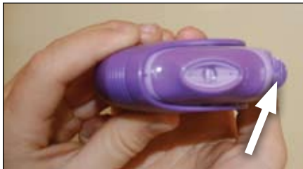
5. Put your thumb on this lever