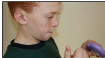
10. Hold your breath for 10 seconds if you can