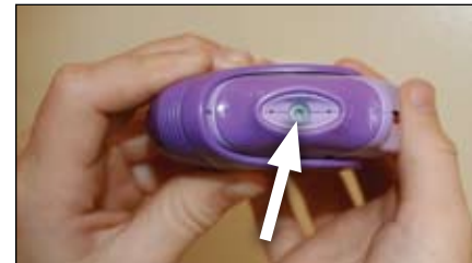
7. Window is open, medicine is inside Do NOT shake