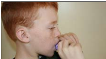
9. Close lips around the mouthpiece Breathe IN fast and deep