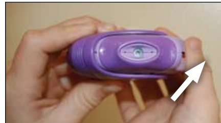
6. Push back to click open