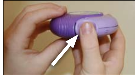
2. Put your thumb here