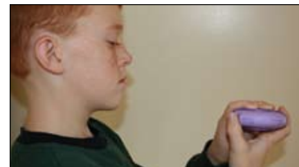
11. Close the diskus