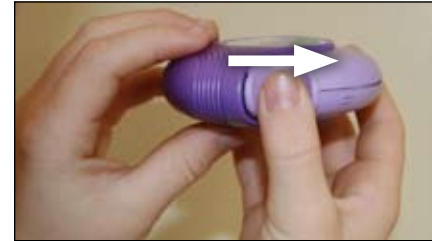
3. Push thumb this way to open