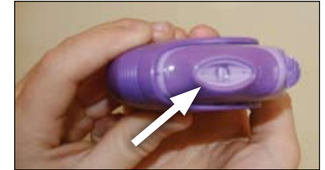
4. Here is the mouth piece